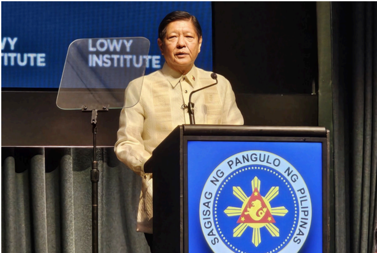
President Ferdinand Romualdez Marcos Jr. urges cooperation between Australia and the Philippines during his speech at the Lowy Institute.